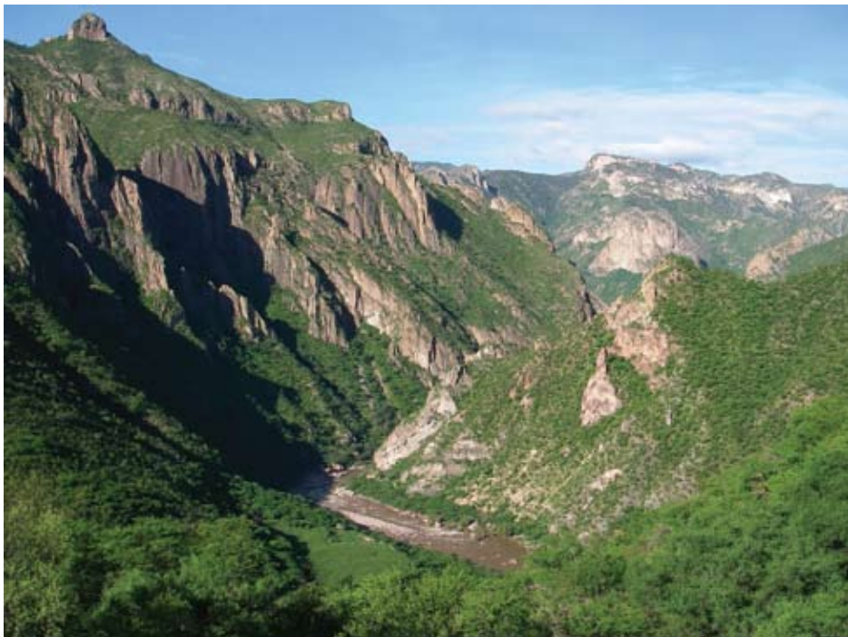
View into Rio Chínipas Canyon just before the confluence with Rio Oteros

One of the highlight sections of this river is the "Gasogachi Gorge," below the village of the same name that sits high above the river. The walls closed in and we were confronted with two major Class V rapids, the first of which I dubbed "Mambo." I was probably thinking more of the venomous "mamba" snake than the Cuban dance at the time, but even after bestowing the label, I decided it still made sense if you think about "dancing with the water" through the rapid, but being bitten really badly if you mess up. I suppose the second one could be called "Mamba." These two Class Vs are